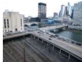
Chestnut Street Bridge in Philadelphia