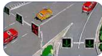
Dynamic Lane Assignments and Junction Control