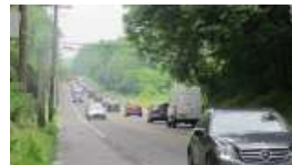
U.S. 322 in Delaware County