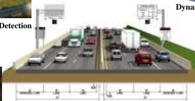
Part-Time Shoulder Use