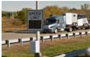
Variable Speed Limits and Queue Detection