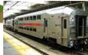
Multimodal Transit Improvements