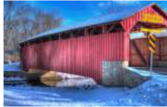
Sullivan's Trail Bridge, U.S. 202-300, I95-GR2 Widening, Speakman Covered Bridge